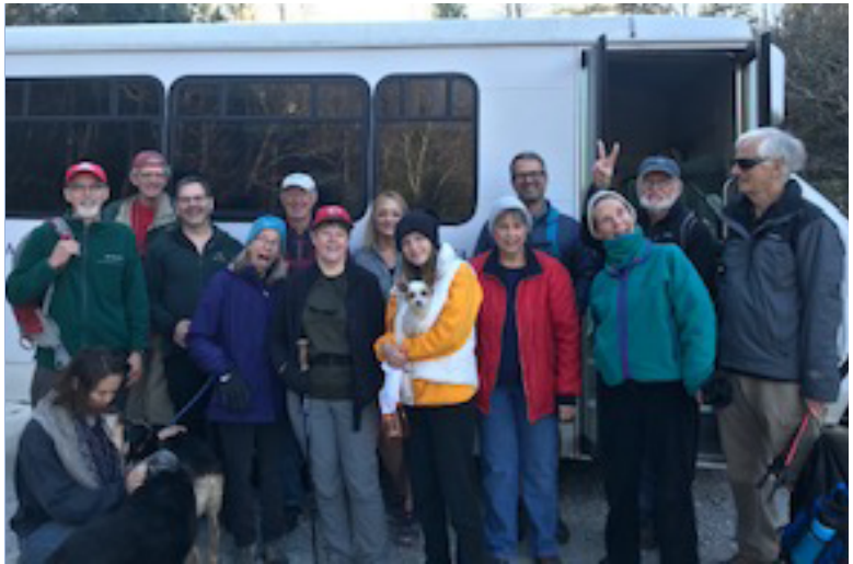
Sunday Hikers conquer Catawba Falls on December 8th!