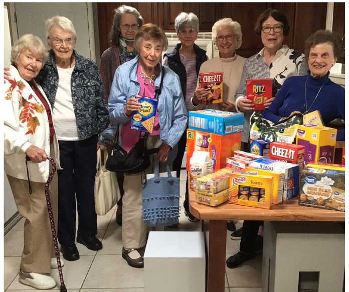
Esther Circle's mission project for the year is to contribute food to the Black Mountain Home for Children, Youth & Families. Each month we will pick a different category. This month it was snacks. The children's home is so appreciative to us and grateful to have help with their food bill.