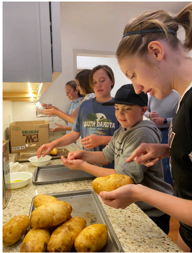
Preparing for the Potato Lunch