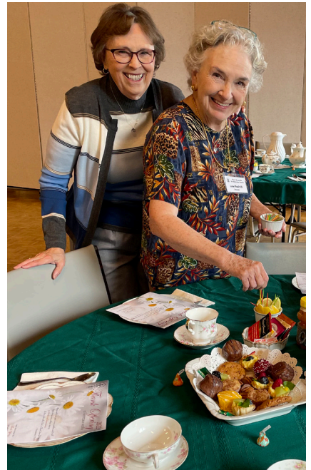
We had a wonderful Sabbath Tea on Sunday, October 16, with over forty women in attendance.