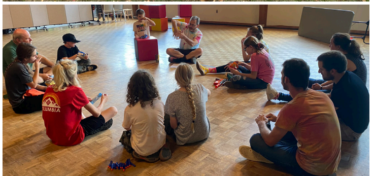
Nerf Wars and Scripture Lesson