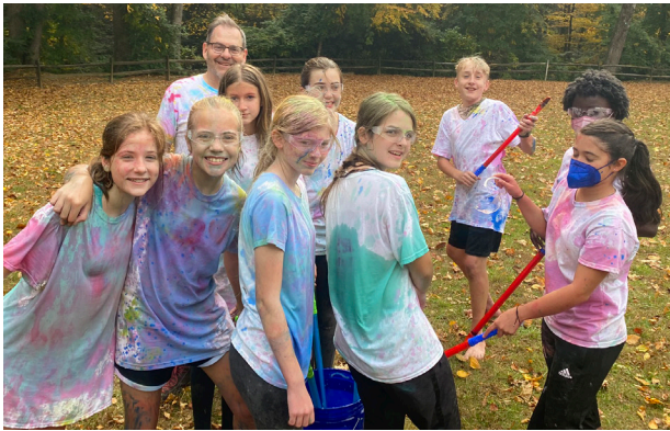
Paint Wars Capture The Flag teams