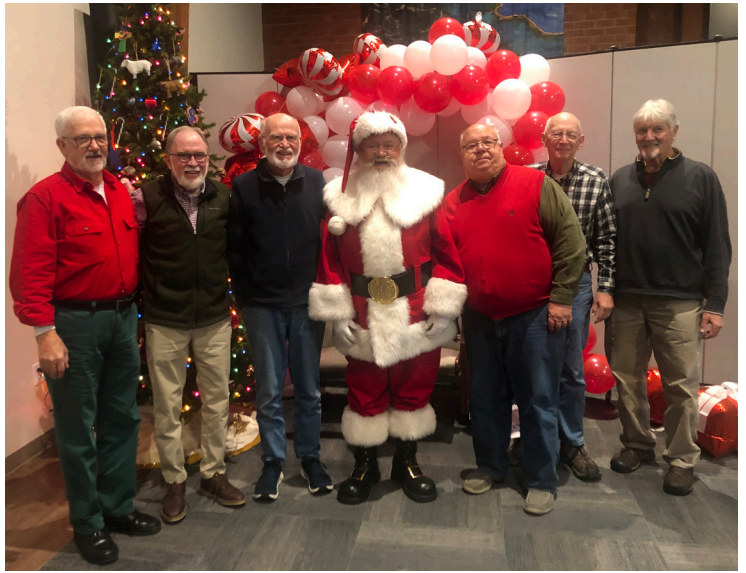
Thank you to the members of the church for your support during breakfast with Santa.

The youth continued service projects during December including filling 650 Christmas Stockings for a group in Burke County, making ornaments for residents at Highland Farms, and adopting teens in the SVCM Johnny Raines Christmas Cheer program. Thank you to church and community members who attended our Breakfast with Santa fundraiser. We raised $801 for service projects, fellowship events, retreats, and conferences!