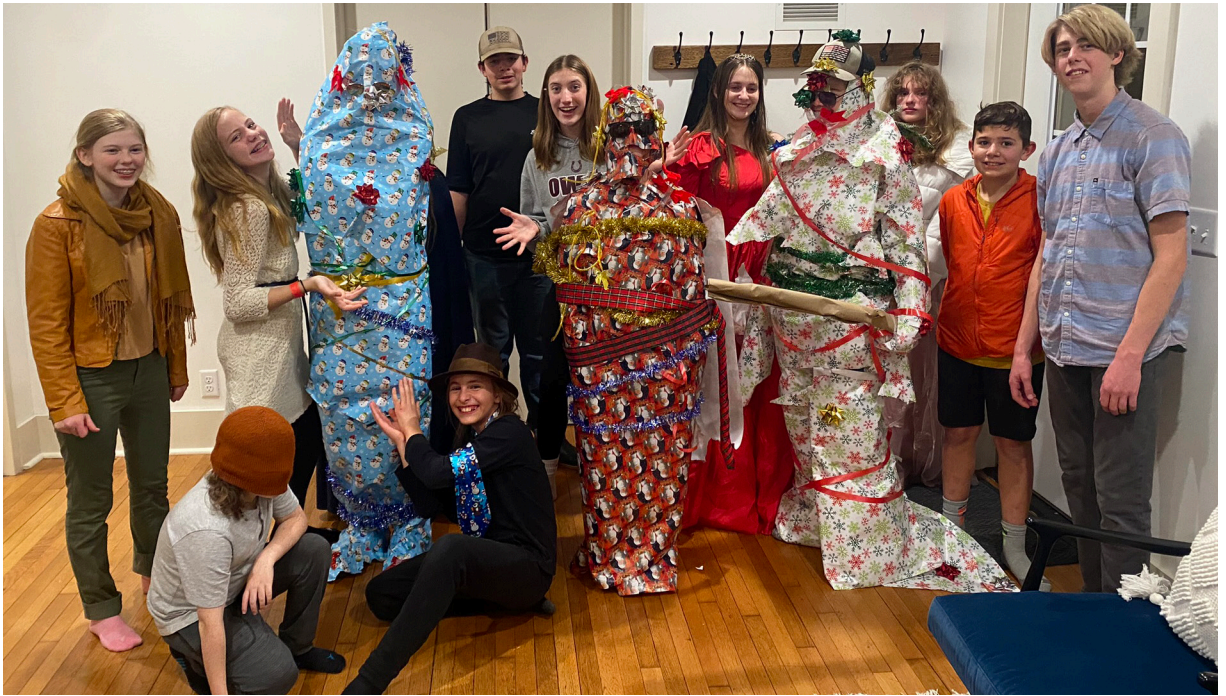
At our youth Christmas party we enjoyed delicious food, a hot chocolate bar, and games including wrapping our advisors as presents since they are truly gifts to our group!