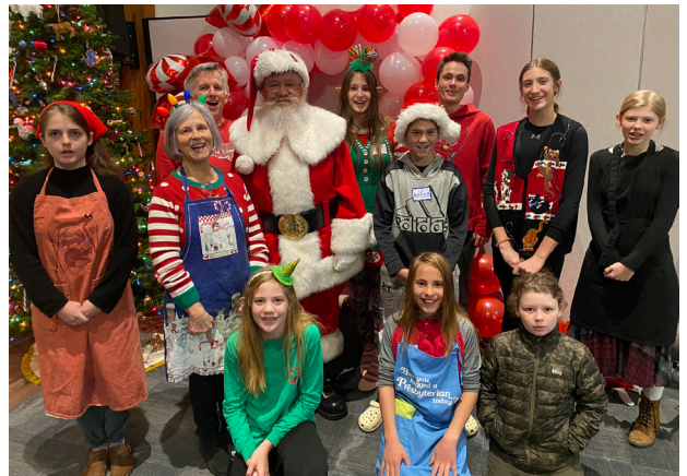
Thank you to the youth for their hard work during our fundraiser!

All 6th-12th grade students are welcome to join us for any and all activities. Bring a friend! Our winter/spring calendar is available on our Facebook page and at bmpcnc.org .