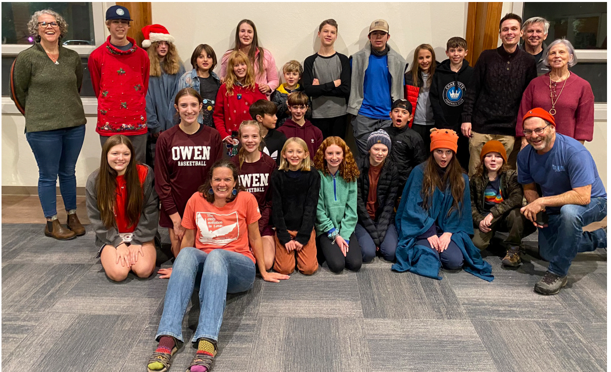
Our youth invited Route 45 and St. James youth group to help us fill the Christmas stockings.