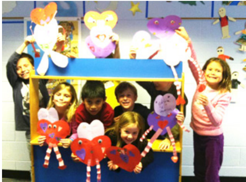
Logos children made valentines for the homeless shelter.