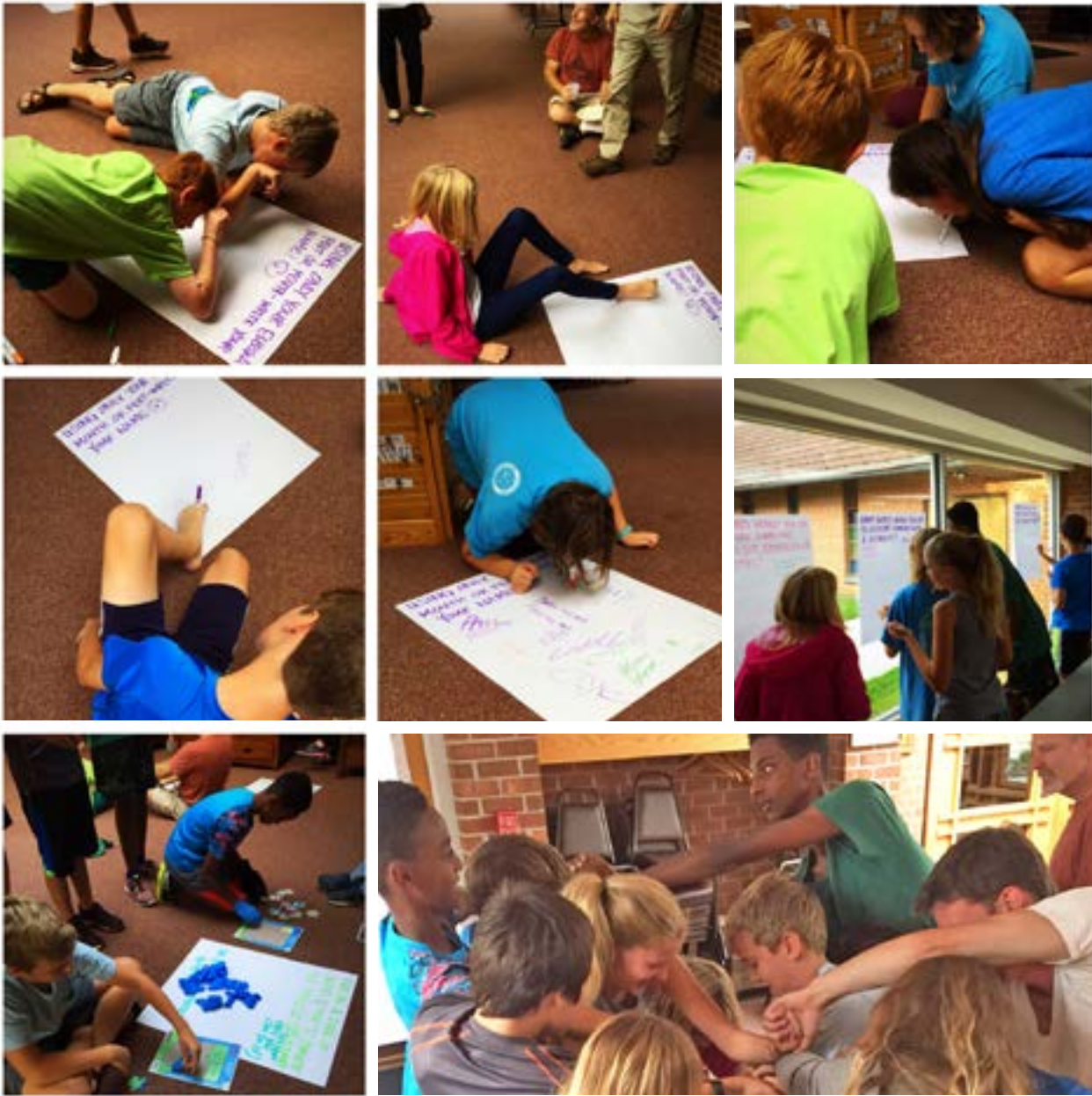
The Middle School Youth participated in activities that highlighted some of the issues that are faced by people who are differently-abled!