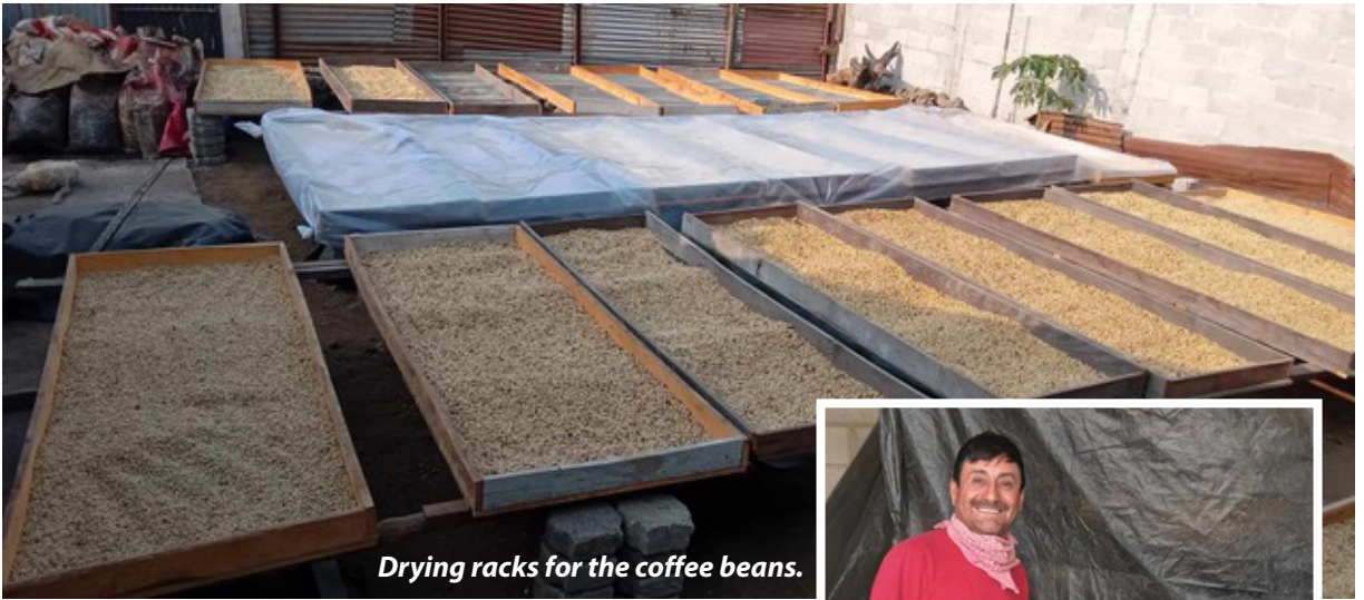
Drying racks for the coffee beans.