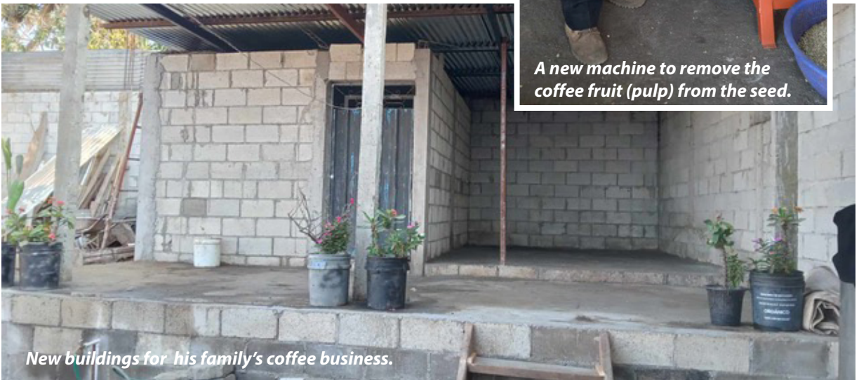
New buildings for his family's coffee business.